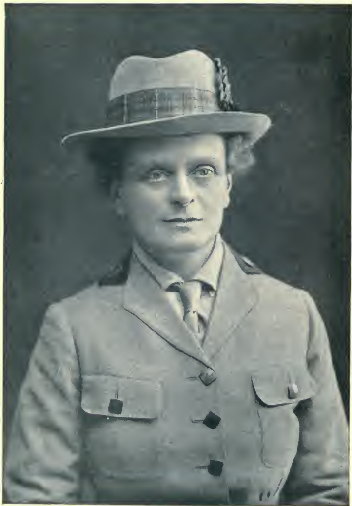
DR. ELSIE INGLIS, 1916